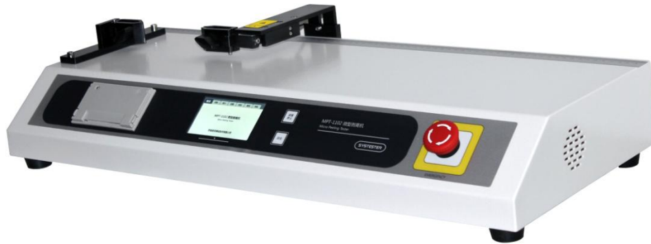
MPT-1102 Micro Peeling Tester